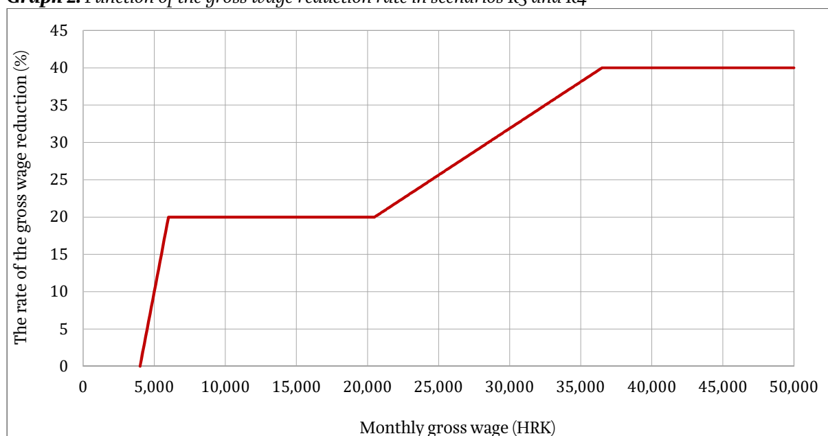
Graph 2. Function of the gross wage reduction rate in scenarios R3 and R4