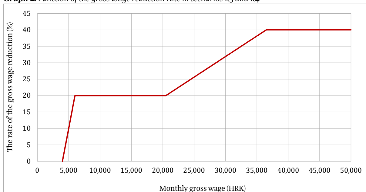
Graph 2. Function of the gross wage reduction rate in scenarios R3 and R4